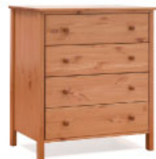
H835 x W750 x D500mm 4 drw chest