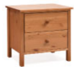
H495 x W510 x D410 mm 2 drw bedside chest

Choose between trundle for sleepover or drawers for masses of storage