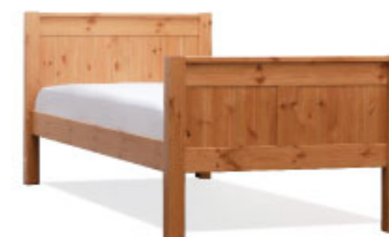
Headboard H850/Foot board H690 mm x W984 x L1984 mm Single Bed