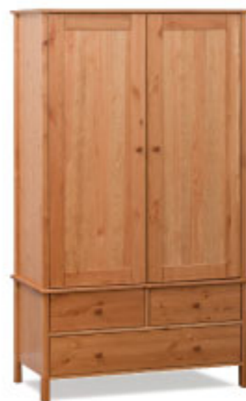
H1722 x W984 x D500mm 2dr/3drw robe