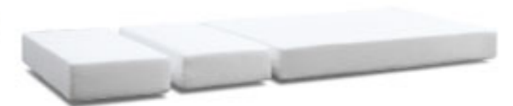
Starter bed foam mattress H135 x W750 x L1760mm