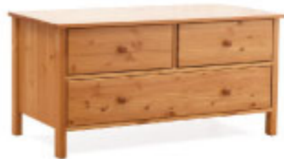
H495 x W984 x D500 mm 2+1 drw chest