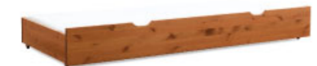
H243 x W786 x L1840 mm trundle bed