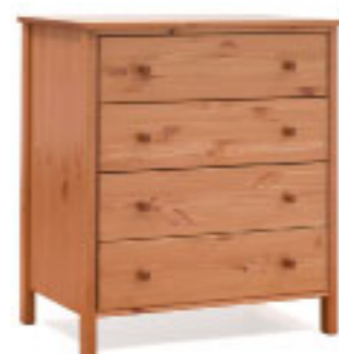
H835 x W750 x D500mm 4 drw chest