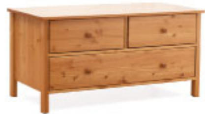
H495 x W984 x D500 mm 2+1 drw chest