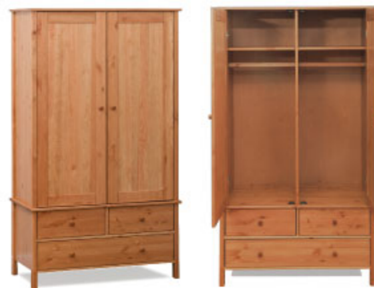
H1722 x W984 x D500mm 2dr/3drw robe