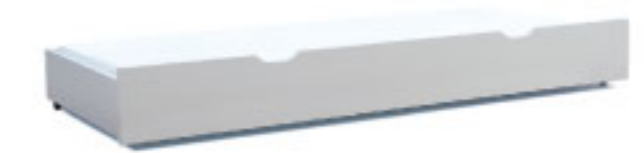
H243 x W786 x L1840 mm trundle bed