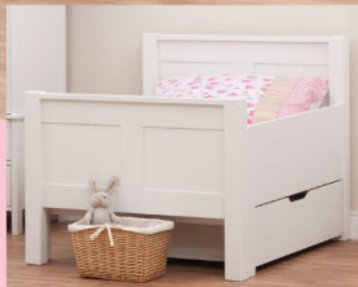
Starter bed shown in smallest size