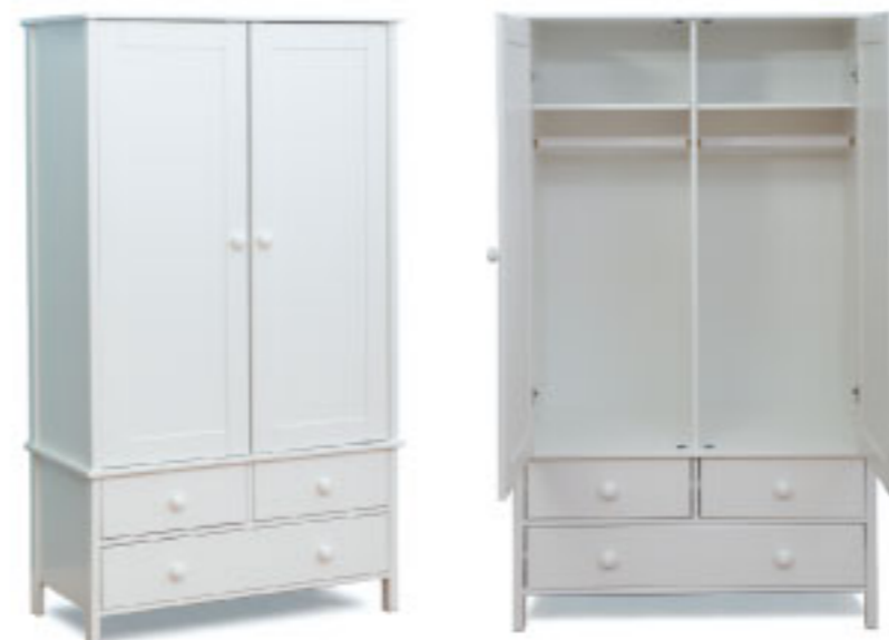
H1722 x W984 x D500mm 2dr/3drw robe