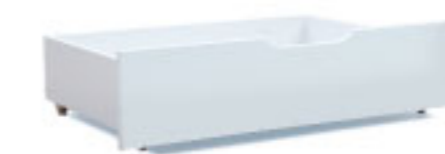
H243 x W920 x D616 mm Single drw