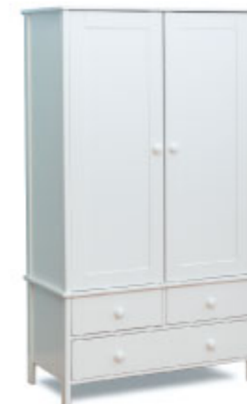
H1722 x W984 x D500mm 2dr/3drw robe