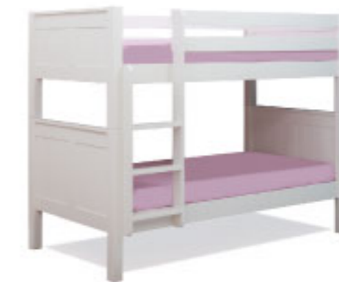
H1540 x W1052 x L1984 Bunk Bed