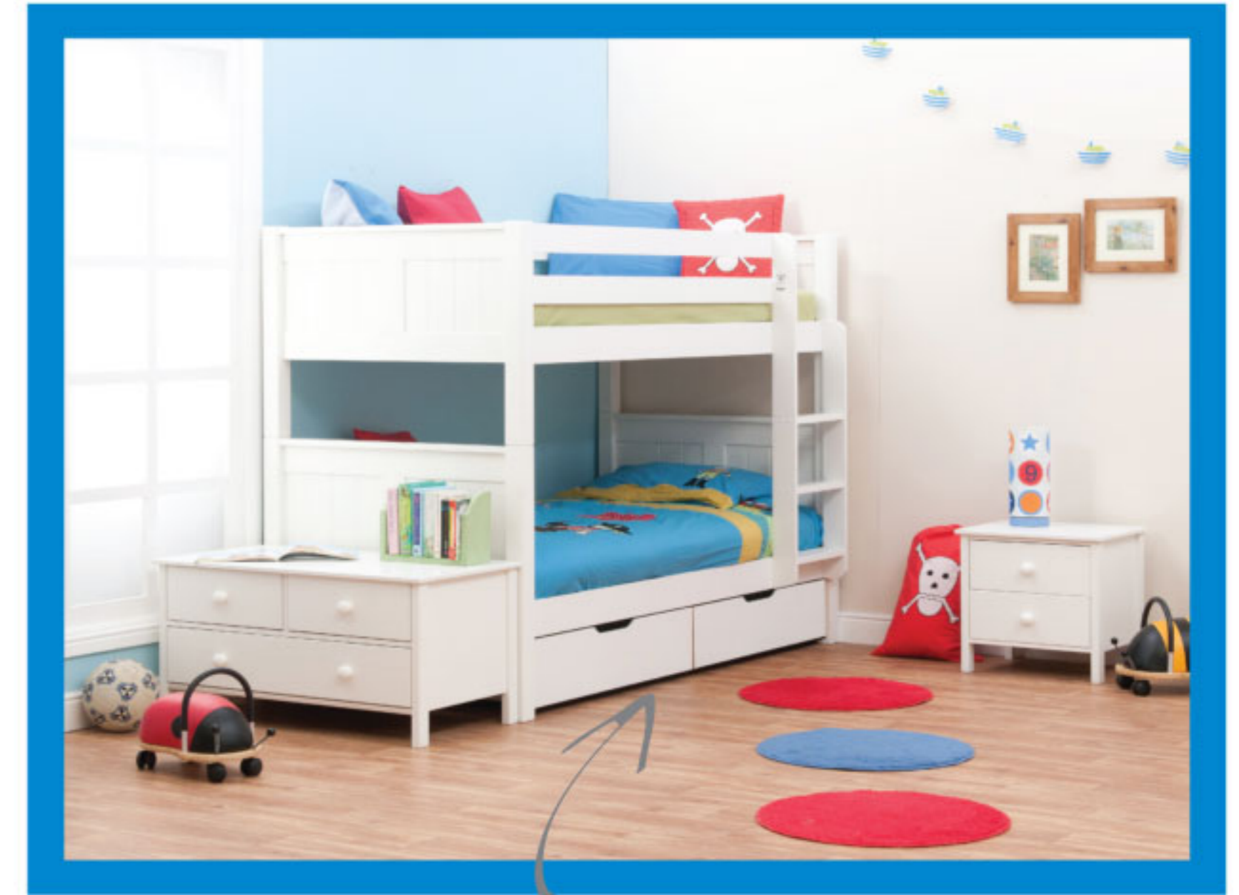
Storage drawers and trundle on wheels!

Bunk bed— never goes out of fashion A fantastic, sturdy bed which converts into two great single beds. Kids love bunk beds it encourages great friendship between siblings and don't forget it is a wonderful space saving bed.