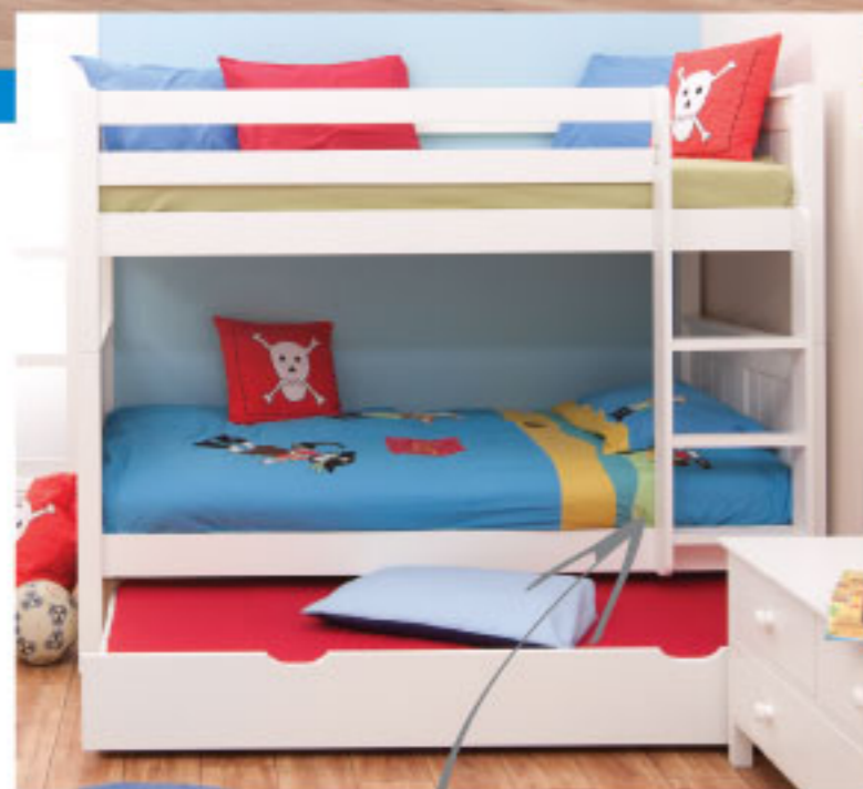
Nice, flat steps on ladders for little feet...

Wonderful matching furniture with spacious drawers and ample hanging space. Beautiful white lacquered finish.