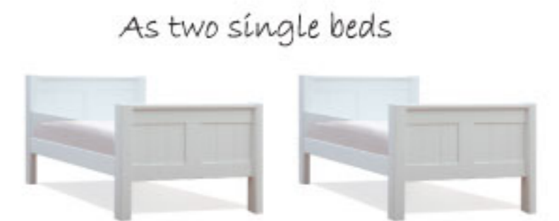
As two single beds