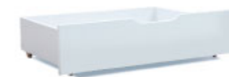
H243 x W920 x D616 mm Single drw