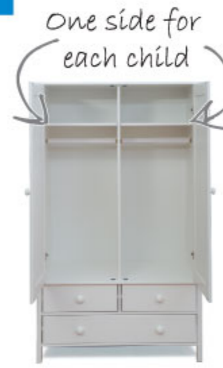
One side for each child