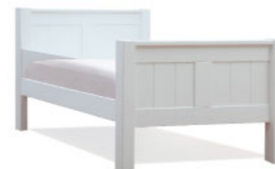
Headboard H850/Foot board H690 mm x W984 x L1984 mm Single Bed