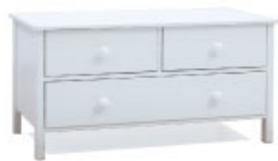
H495 x W984 x D500 mm 2+1 drw chest