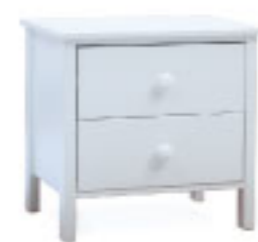
H495 x W510 x D410 mm 2 drw bedside chest

Wonderful matching furniture with spacious drawers and ample hanging space. Beautiful white lacquered finish.