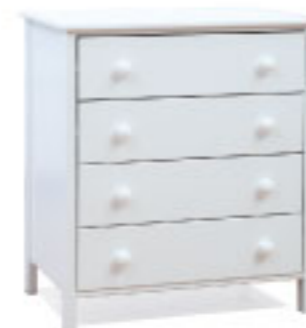
H835 x W750 x D500mm 4 drw chest