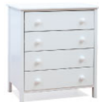
H835 x W750 x D500mm 4 drw chest