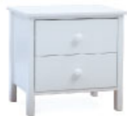
H495 x W510 x D410 mm 2 drw bedside chest